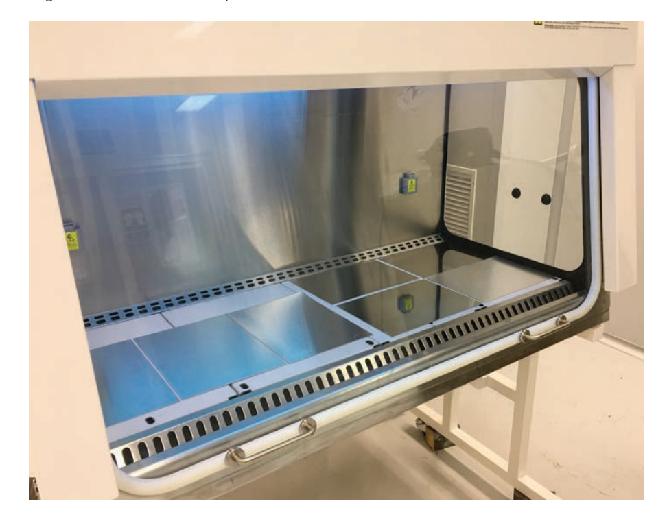
Figure 2: Telstar cabinet and plates distribution.

Ten stainless steel plates were prepared. They were divided in three equal parts, to ensure that each of them, would represent a different time of analysis. The measurements were done at 0, 2 and 12 days from the start of the treatment. Every plate was contaminated with 3 mL, homogeneously distributed by vertical, horizontal, and diagonal movements.