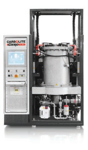
The HBO 60 MO/13-1G with automatic software control and high vacuum pumping unit.

Schematical drawing of the HBO 60 MO/13-1G. The usable volume has a diameter of 400 mm and a heated height of 500 mm. The maximum temperature is 1300°C. Argon can be used to flood the furnace in partial pressure mode.