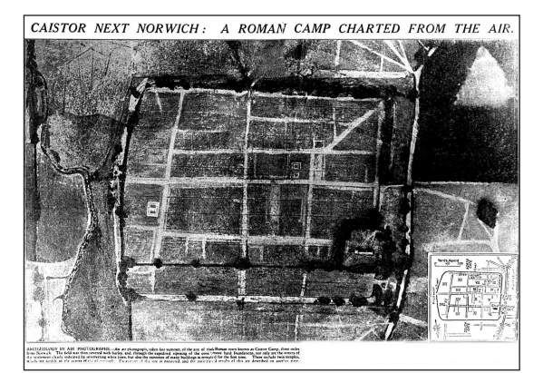
Figure 1. The 1928 aerial photograph of Caistor (Venta lcenorum) as originally published by the Times. Its publication caused tremendous excitement and led to immediate

In light of this, in 2006, the University of Nottingham's Caistor Roman Town Project was conceived, with the aim of establishing a long-term research project at Caistor. One of the initial aims was to implement a fast high-resolution geophysical survey, to create a detailed map of surviving sub-surface remains. The site's protected status means that any excavation must be limited and targeted on specific areas and research questions. The geophysical survey would enable the project to identify such areas. To date, the project has surveyed more than 30 hectares of land.