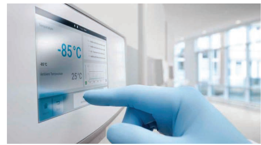
State-of-the-art touchscreen technology features a distinct design across all systems

The VisioNize-bioprocess software works as a hub to integrate your bioprocess equipment into the system. The bioprocess software acts as a gateway system and connects the DASware control software for small-scale bioreactor systems directly and easily to VisioNize core via network.