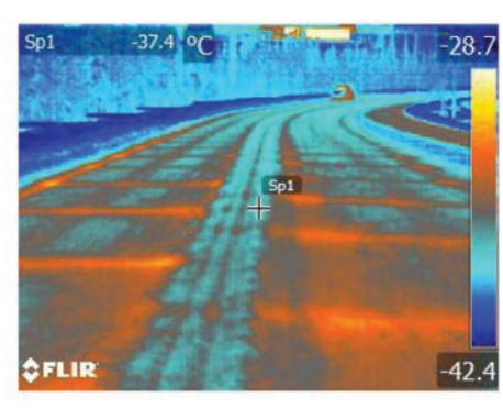
Thermal imaging can be used to see whether cooling devices of road infrastructures are working effectively.