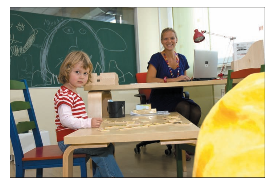
Playing with puzzles in the sunshine room.