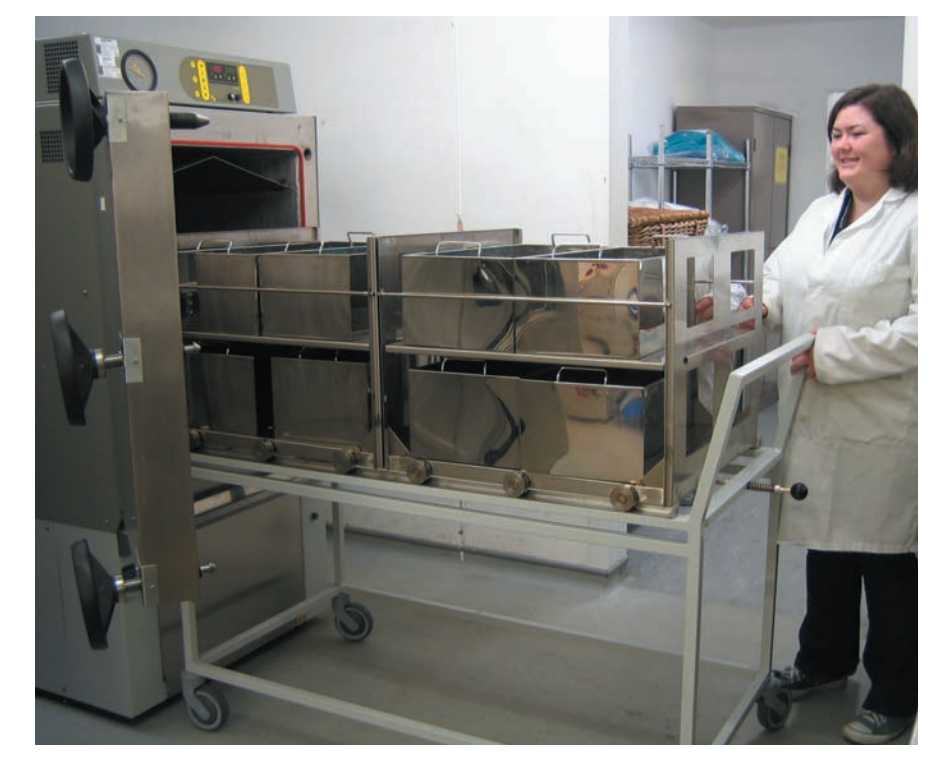
from the boiler house to the autoclave and if the boiler is shut down or at low pressure for repair or routine maintenance then the autoclave will be out of use. However, some autoclaves are available with dual-heating arrangements allowing electrical heating to be used when boiler steam is not available.

Autoclaves with In-Built Steam Generators are obviously more expensive to purchase and installation cost is higher as they require plumbing and drainage facilities for the water