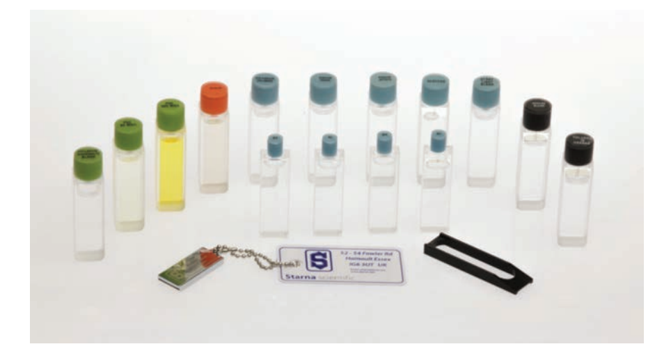
Figure 2 - Typical set of Certified Reference Materials for Pharmacopoeia Compliance

Much pharmaceutical analysis is performed using methods issued by the various Pharmacopoeias, who set their own criteria for instrument qualification. Specifications are published for absorbance accuracy and linearity, wavelength calibration and spectral bandwidth, and sets of reference materials are available commercially to qualify instruments to these criteria.