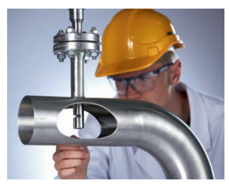
Figure 7: Industrial probes for process monitoring/control

The rapid growth of MEMS (Micro Electro-Mechanical Systems) in spectrophotometer design has led to many new micro-modular systems being available from a broad range of manufacturers. These have all strongly supported the application-specific approach to satisfying the analytical and measurement requirements of individual customers; creating in effect a growing market for bespoke optical instrumentation. The adaptability and flexibility of optical immersion probes makes them an ideal