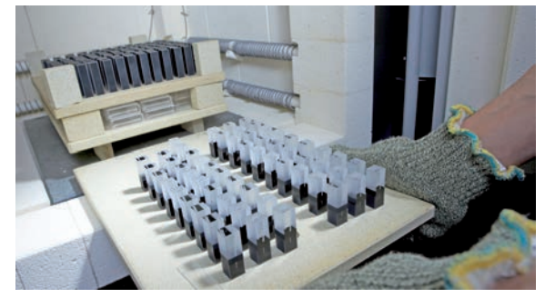
5 Figure 3: Cuvettes being stacked in an oven for the fusion process

Finally, before assembly all the parts are cleaned in an automated, multi-stage, precision-cleaning process that is computer controlled and under clean-room conditions. Because of the flatness and cleanness of the surface finish the edges can then be joined by