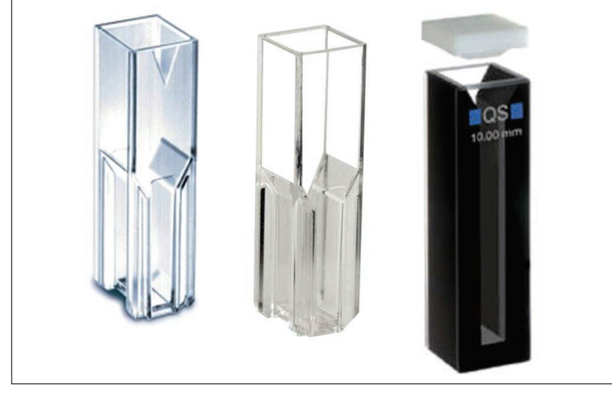
Figure 5: From left to right unmasked and partially masked plastic cuvettes along with a fully self- masking quartz cuvette

Figure 4 (a) surface scan of a quality cuvette