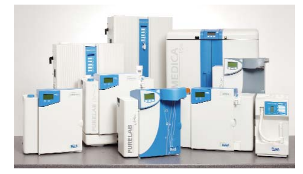
Figure 1. The PURELAB range

Meeting this specification from mains water means that the PURELAB Option-Q has to cram a lot of technology into a small, bench-top cabinet ( Figure 1 ), as the flow diagram ( Figure 2 ) shows.