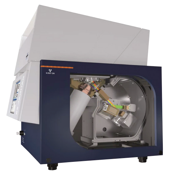
Fig. 1 HighSense™ Technology.

The WDXRF spectrometer S6 JAGUAR is equipped with Bruker's 400 W HighSense™ X-ray tube (Fig. 1). This makes the S6 JAGUAR the most powerful benchtop WDXRF unit on the market! Modern software with built-in audit-tracking and state-of-the-art hardware enables best-inclass analytical performance. The S6 JAGUAR achieves outstanding sensitivity for a wide range of elements (F to U) and the various configuration options allow us to optimise the system for your needs.