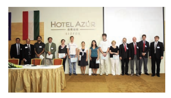
Prize winning scientists at the Balaton Symposium 2009 in Siofok, Hungary, where the EuSSS' new steering committee was elected.