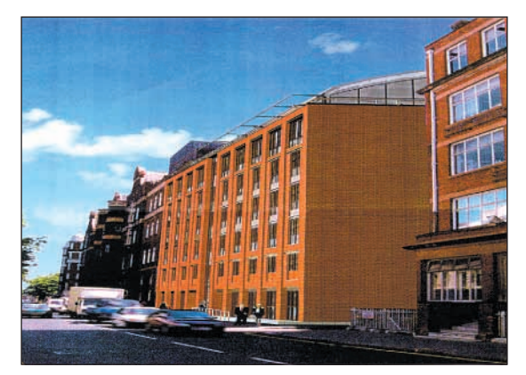
Chelsea Site, Central London

Florence Raynaud (FR): I work at The Institute of Cancer Research (ICR) in the Section of Cancer Therapeutics. Our mission is to discover and develop new drugs to treat cancer. We have an impressive track record in drug discovery in oncology as four compounds (melphalan, chlorambucil, carboplatin and ralitrexed) originating from the ICR have gained regulatory approval. In addition, we have several compounds in late clinical development (abiraterone, satraplatin and picoplatin). Six of our compounds are in early phase I/II clinical evaluations. They include conventional antiproliferative agents that are selectively transported to tumours and molecularly targeted agents such as HSP90, HDAC and PI3K inhibitors. These compounds have been licensed to pharmaceutical companies such as Novartis, Roche, Genentech and Onyx pharmaceuticals and some of them have been developed in partnership with biotechnology companies. We have an exciting pipeline which includes PKB inhibitors already licensed to Astra Zeneca, while B-RAF inhibitors, CHK1 and Aurora kinase inhibitors are all at licensing stage.