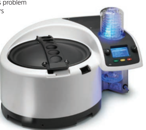
Figure 2. Rocket Evaporation System

Importantly, with reverse phase HPLC fractions the sample is usually dissolved in a mixture of water and organic solvent (acetonitrile or methanol), whereas, samples in the other applications are normally in a single organic