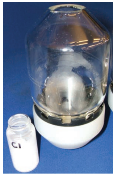
Figure 4. Flask showing minimal sample sticking with added 1,4-dioxane

One 'non-stick' solution considered was to end terminate the free silanol groups on the glass molecules, typically with a silane. Several commercially available treatments where tried, however, none of these coatings were that successful, the samples still crashed out, and still adhered to the side of the flask. The use of the silane treatment did help move all the sample closer to the neck of the flask but none was considered adequate. In addition, none were permanent, in that they were removed over time by washing of the flask. The flasks were also coated with a Teflon® type material, however, those providing this material had difficulty in ensuring the adhesion between the coating and the glass, and delamination was a risk. This solution was dismissed.