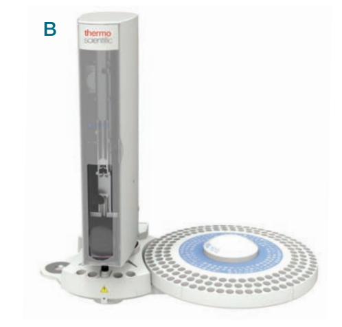
Figure 1. (A) AI 1610 autoinjector with 8-vial capacity; (B) AS 1610 autosampler with 155-vial