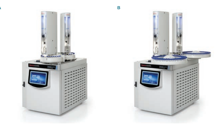
Figure 2. Thermo Scientific TRACE 1610 GC equipped with (A) Gemini AI 1610 (total of 8-vial capacity); (B) Gemini AS 1610 (total of 310-vial capacity).