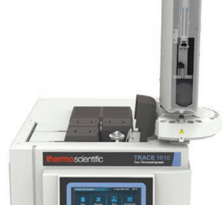
Figure 3. Design of the AI/AS 1610 autosampler. Easy access to the inlet port is achieved through a sliding support.