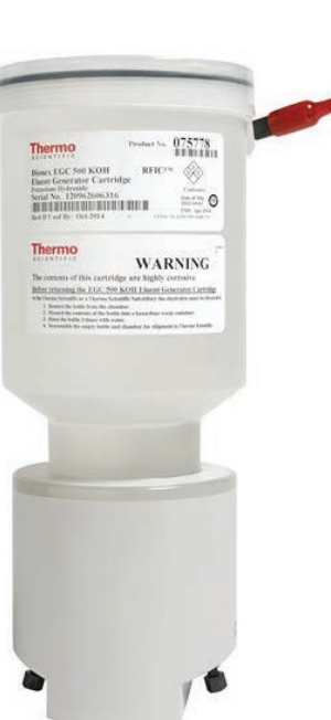
Figure 2. Thermo Sceintific Dionex EGC-500 cartridge.

For ion analysis, nothing compares to a Thermo Scientific™ Dionex™ ion chromatography (IC) system. Thermo Fisher Scientific has been empowering scientists with innovative Ion Chromatography technology for 45 years across the environmental, industrial,