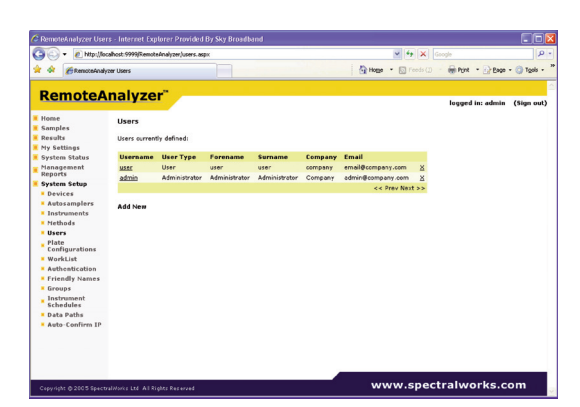
Figure 3. RemoteAnalyser Administrators Page