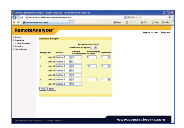
Figure 2. RemoteAnalyser User Sample Login