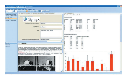
Figure 1. Symyx Notebook 6.1 lets biologists load reports from a biology data management system; capture observations in real time as they record results; annotate and summarise results; and make decisions based on all parameters (whether recorded, processed, or observed).

Extension points include integration with statistical analysis, kinetic modeling, and PK/PD modeling software as well as a variety of instruments and database systems including LIMS for sample management and data repositories such as the Waters NuGenesis SDMS. Integration with the company's own Assay Explorer biology data management system or Plate Manager software can also speed the collection, analysis, and reporting of biological results ( Figure 1 ).