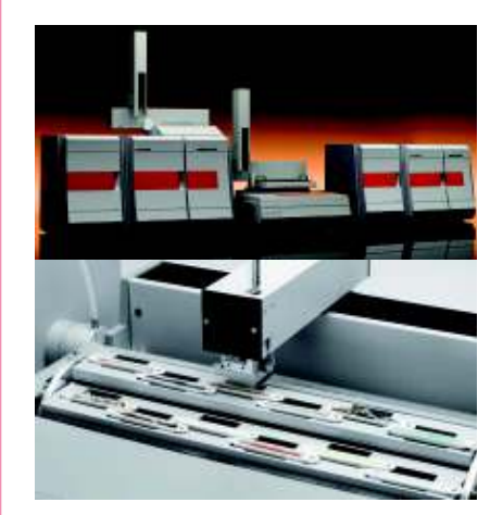
Figure 1. a) The elemental analysis systems of the multi EA® series. b) Solid autosampler FPG 48.

multi EA® 4000 – for determinations at macro level:Base device with high-temperature furnace;