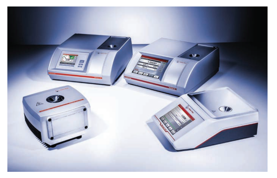
Figure 2. Abbemat refractometers from Anton Paar are capable of measuring the concentration of acids and bases within seconds from just a drop of sample. They are a very economical alternative to conventionally used titrators.

Abbemat refractometers measure the concentration of acids and bases independently of the operator within seconds with no need of user interaction: The operator just needs to apply a drop of sample on the measuring prism of the refractometer and press 'Start'.