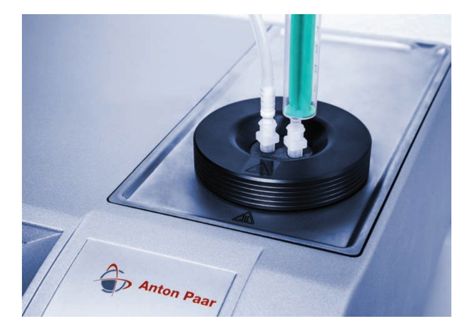
Figure 3. A micro flow cell attached to the measuring prism of an Abbemat refractometer allows convenient concentration measurements of aggressive or toxic chemicals and avoids human contact with the chemical.

For these applications the Abbemat refractometer can be equipped with a micro flow cell made of PFA, which is resistant against strong acids or bases. The flow cell is conveniently filled by using a syringe and makes the handling safe for the operators because they do not get in contact with the acid during the measurement.