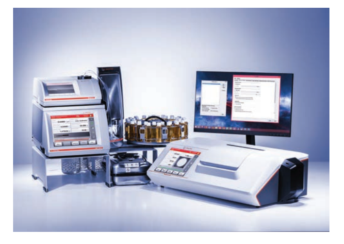
Figure 3. A Modulyzer system, with Xsample and waste vessel.