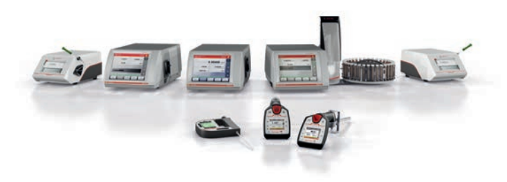
Figure 2. The family of Anton Paar benchtop density meters and the portable DMA 35.

The FillingCheck<sup>™</sup> function makes it possible to detect filling errors, also in metallic U-tube oscillators. This is also valid for measurements up to 150°C. Detecting filling errors allows avoiding them.