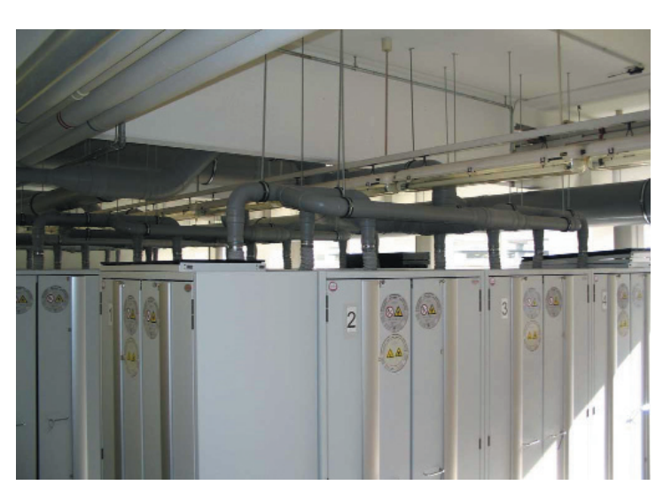
More than 50 safety storage cabinets connected to a central ventilation system