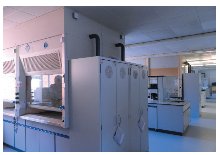
Type 90 safety storage cabinets according to BS EN 14470-1 in a laboratory at Sussex University