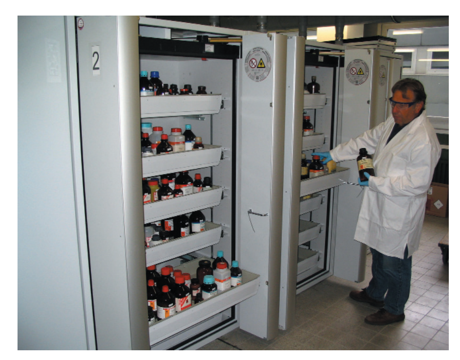
Safety storage cabinets according to BS EN 14470-1 in a laboratory at Gießen University