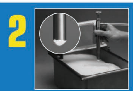
DIP THE GUN into the product trough. Powder is instantly picked up into the barrel at a controlled, even density.