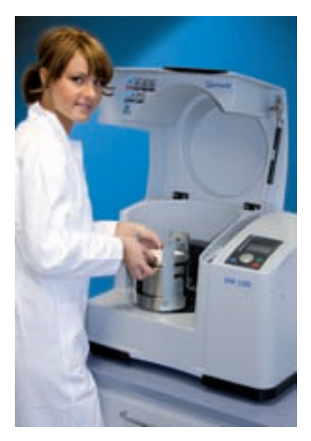
Figure 1. Planetary Ball Mill PM 100.

in classic laboratory synthesis). However, the synthesis conditions such as pressure, temperature, degree of size reduction and particle size distribution can only be controlled in a limited way.