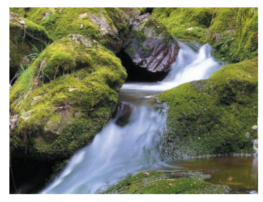
Corporate environmental policies and practices go hand in hand with natural resource preservation and a positive corporate image.

In the overall scheme of capital expenditures the integration of a recirculating chiller into a corporate-