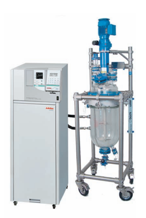
Demanding applications require powerful highly dynamic control systems providing a wide temperature range with quick response times.