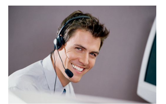
Proper maintenance and service contracts provide insurance to keep your process running and give you peace of mind.

Another option supports communication between the chiller and a handheld wireless remote control. This remote control communicates with up to eight chillers monitoring actual and set temperatures and displays the start/stop and alarm status. This frees operators from constantly walking up to the chiller to monitor settings and allows for adjustment of the set point and start/stop of the chiller while 'on-the-go'.