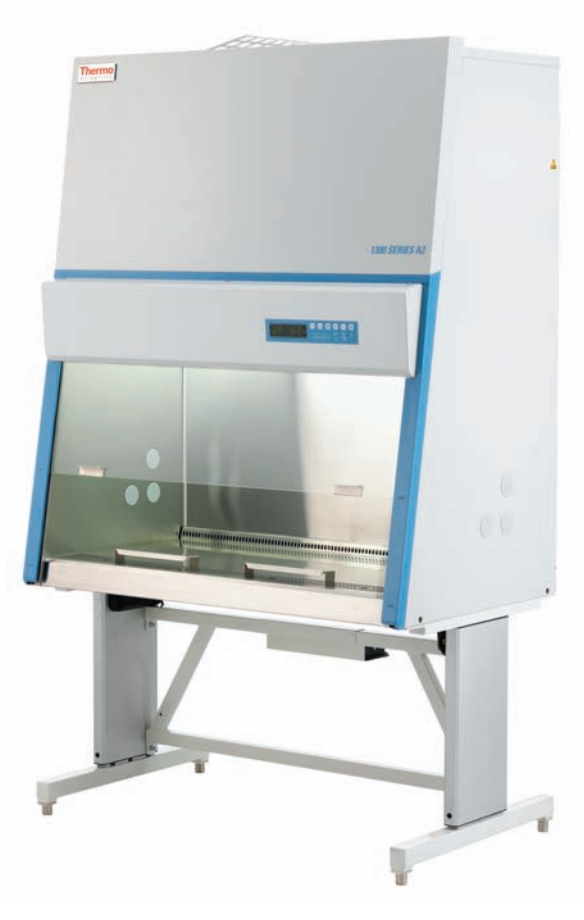
Figure 1. The Thermo Scientific 1300 Series A2, Class II Type A2 biological safety cabinet delivers exceptional design and technology advancements such as superior protection with patented airflow design, exceptional ergonomics for a safe and comfortable environment, and outstanding energy efficiency for operational cost savings

Table 1 shows the power consumption for four different 1.2 meter wide BSCs, along with life-time power consumption and cost. This has been calculated using an assumed lifespan of 15 years and usage of forty hours per week.