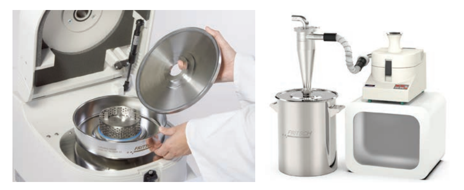
Figure 1: Inside of a Variable Speed Rotor Mill PULVERISETTE 14 classic line, showing fixed collection vessel, rotor and sieve ring. The stainless steel Cyclone separator is shown on the right.

Small-scale homogenisation of CBD isolate may be achieved by low energy ball milling or by automated mortar and pestle. Larger batches may be processed in a continuous manner by using a Variable Speed Rotor Mill with a Cyclone separator.