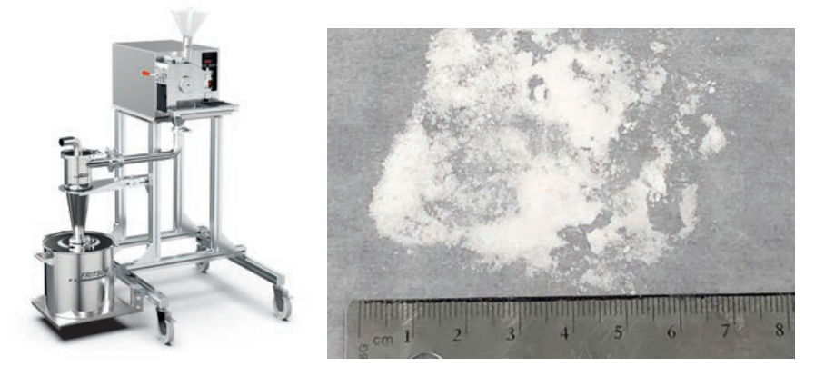
Figure 2: The left image shows a cutting mill system, shown with a Cyclone separator mounted to 60 L collection vessel. The right image shows CBD isolate homogenised into the low-mid micron range using the Universal Cutting Mill PULVERISETTE 19 instrument.