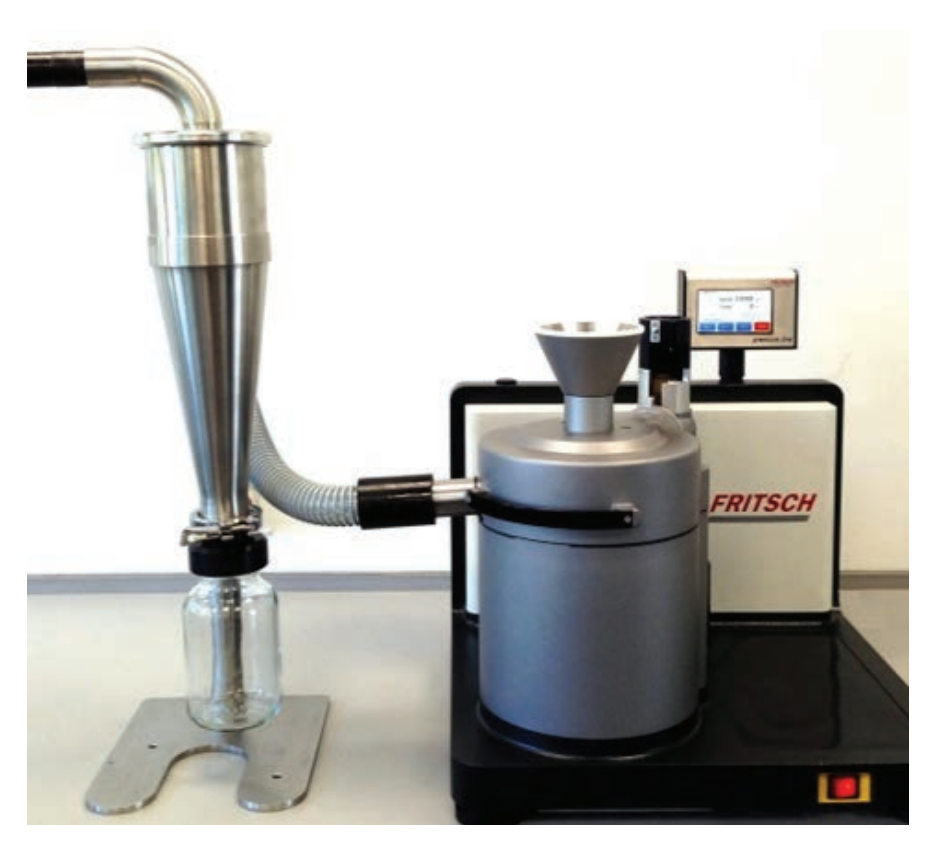
Figure 4. PULVERISETTE 14 premium line with stainless steel Cyclone Separator converted for the comminution of larger amounts

After comminution, the sample is therefore directly and precisely transferred into the collecting vessel. Due to the increased airflow the sample and grinding parts are additionally cooled and the temperature of the system remains constantly below 65°C [6] – the critical temperature for \beta -glucan.