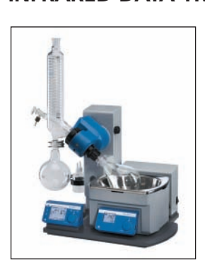
Figure 1: The RV 10 control tops off the RV 10 range from IKA, which comprises three rotary evaporators.

Until now, automatic distillation systems have predominantly been controlled by an automatic pump stand using differential pressure measurements. The new IKA system works on a different principle. Included in the RV 10 control is an infrared interface for bi-directional data transfer between the heating bath and the drive unit. This means that the heating bath can be moved to a safe position directly by the drive unit if a fault is detected. IKA has also