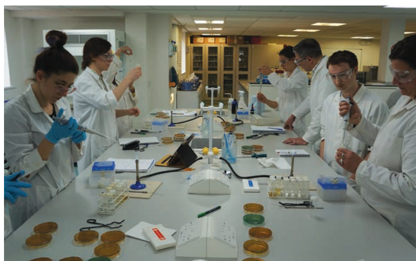
BSc students conducting selective plating of wine microorganism

Allied to her winemaking teaching duties at Plumpton, Sarah will also take responsibility for all the commercial side of Plumpton Wine Estate, including the wine sales activity.