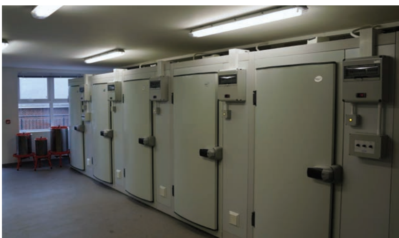
CEC installation in the winery