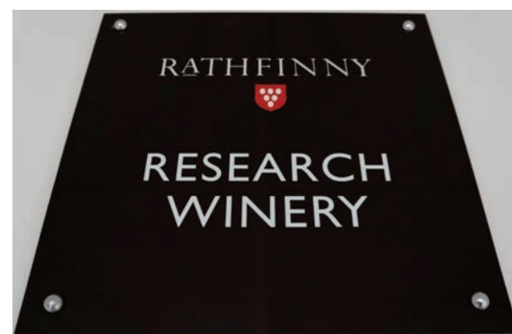
Research winery kindly sponsored by Rathfinny Estate

The new centre is sponsored by over 50 English wine producers, including the nearby Alfriston- based Rathfinny Estate and Chateau des Sours, near Bordeaux; it also has close links to traditional wine-producing areas such as Champagne and the Rheingau in Germany.