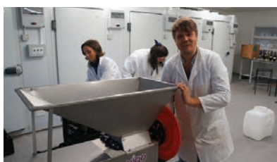
MSc students processing grapes

"We have seen student intake increase by around 30% with numbers currently about 140 full-time and 250 part time attendees. We are hopeful that the numbers on the MSc course will continue to rise considerably, eventually making it the industry standard qualification rather than the current BSc level."