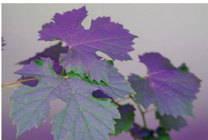
Bacchus Vine growing under LED light