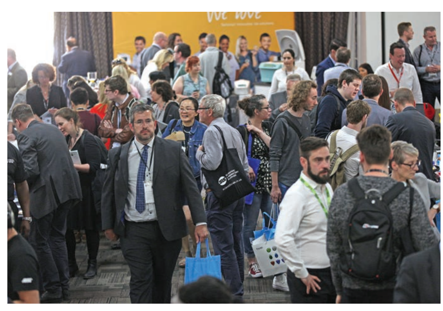
The Scientific Laboratory Show and Conference 2020 is a must-attend event