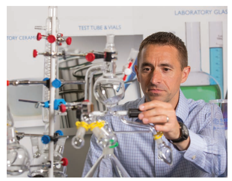
Visitors will be able to see the latest products and equipment on show

Companies looking to bring eight or more delegates can benefit from free transportation arranged by SLS. Email showenquiries@scientific-labs.com to request more information.