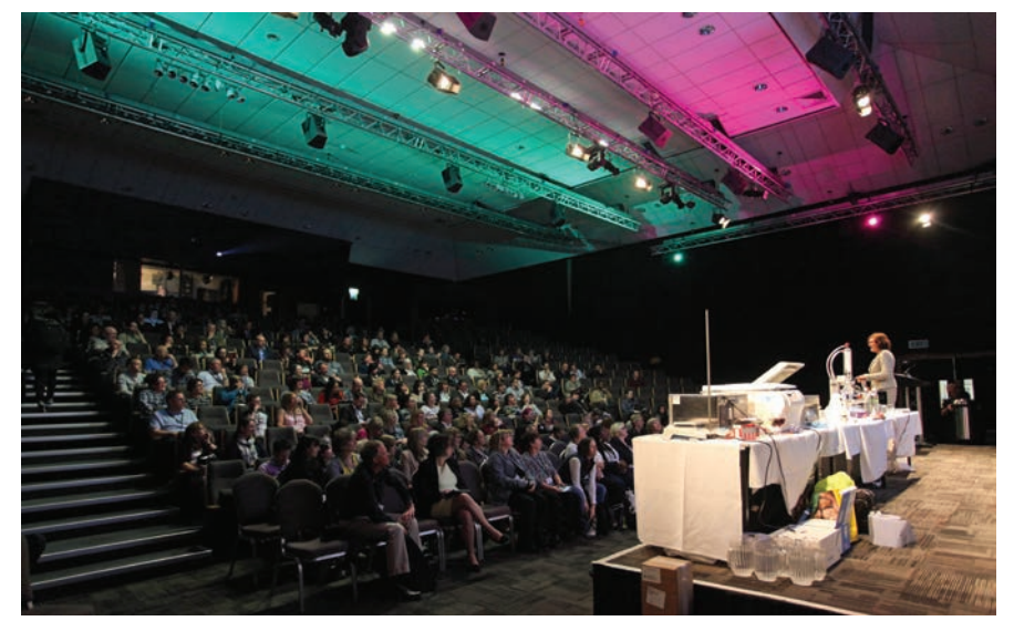
A packed conference programme is planned

The Scientific Laboratory Show and Conference 2020 is once again returning to the East Midlands Conference Centre at the University of Nottingham on Wednesday 20<sup>th</sup> May 2020. This free event, organised by Scientific Laboratory Supplies (SLS) – the UK's largest independent supplier of chemicals, laboratory equipment and consumables – community, offering an opportunity to meet like-minded people, learn new things and see the very best scientific technology and equipment for the laboratory.