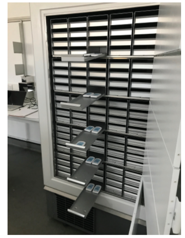
Figure 1. ULT freezer fully racked with temperature loggers in place.

The data was collected over a two week period at the Department of Plant Sciences, University of Oxford. The Eppendorf ULT freezer (F570h) tested was supplied for the study by Scientific Laboratory Supplies Ltd and the racking was supplied by Wesbart. The racking was made of aluminium in the format of front opening outers designed to house standard cryoboxes. The total weight of the aluminium racking used was 90kg. The unit was tested in an air conditioned laboratory where the ambient temperature was recorded at 19°C (+/-1°C). The ULT freezer had a temperature logger placed at the centre point of each of its shelf, with a further