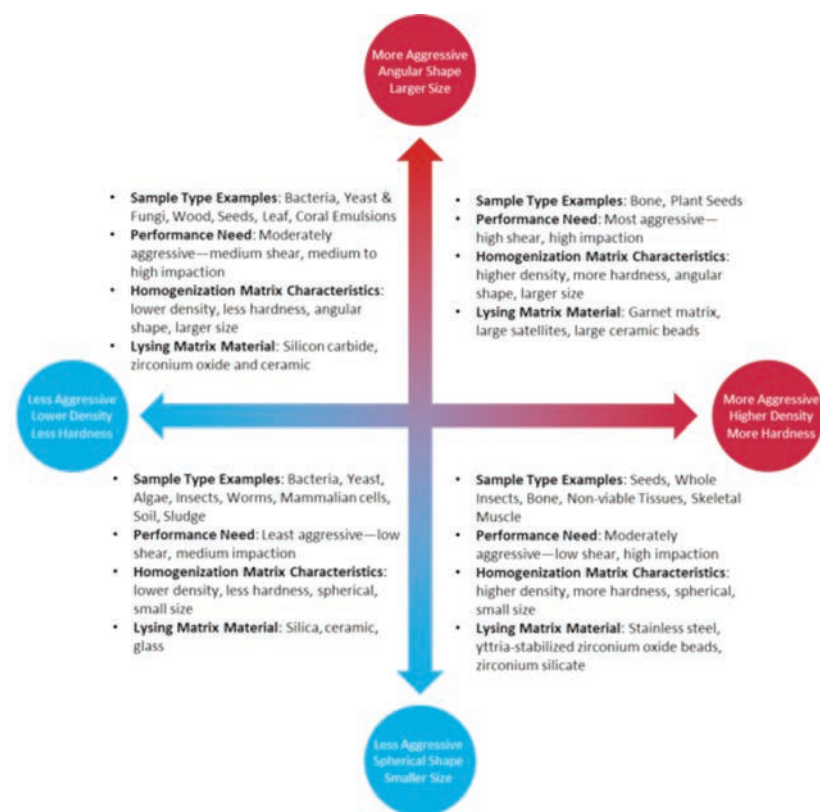
Figure 1: Diagram detailing the application need and potential matrices used to homogenise example materials (image published with permission from Omni International).

GC-VUV uses the power of high resolution GC separations with the enhanced analytical scope and selectivity of the non-destructive VUV detector, for reliable qualitative and quantitative analysis. VUV offers significant potential for measuring substances across a broad range of applications given almost all chemical species strongly absorb at VUV wavelengths due to the excitation of a broad range of high energy electronic transitions (see