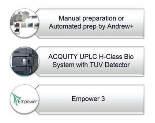
Figure 2. Systems and software used in the AccQ \bullet Tag workflow.