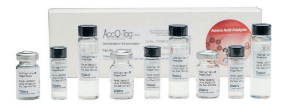
Figure 1. AccQ•Tag Ultra Derivatization Automation Kit.

The preparation and analysis of samples is a time-consuming process that can dominate an analyst's time in the laboratory. Automated laboratory preparation systems provide the flexibility of freeing analysts time for other tasks, resulting in a more efficient way of time management. Waters has created automated sample preparation protocols for the Andrew Alliance Andrew+ platform in conjunction with the AccQ@Tag Ultra Derivatization Automation Kit ( Figure 1 ) and amino acid standard kits. The AccQ@Tag Ultra Derivatization Kit for automation scales up reagent volumes necessary for use with automation systems due to their increased dead volume requirements. The reagent volumes provided allow for the preparation of up to 96 samples in a 3 x 32 sample format.