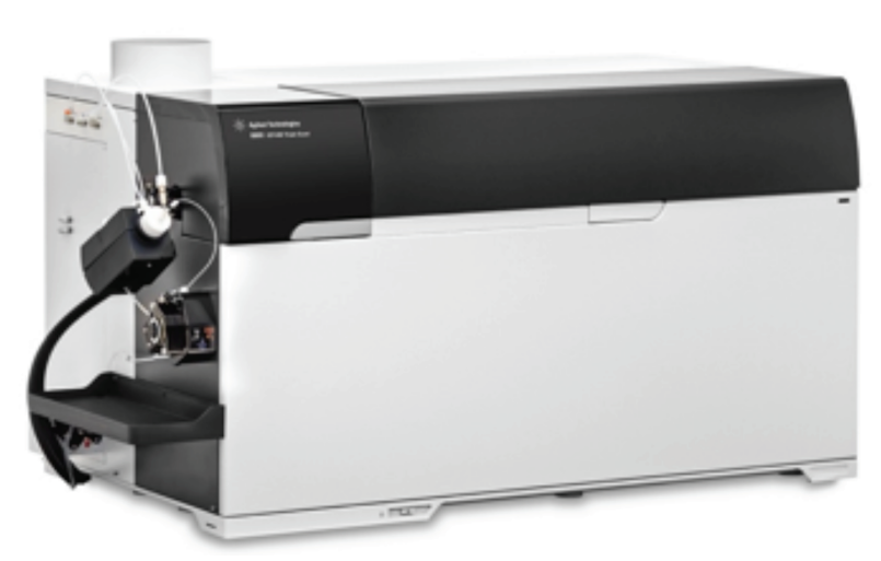
Figure 1. Agilent 8900 Triple Quadrupole ICP-MS system.

Announced the launch of the Agilent 8900 Triple Quadrupole ICP-MS system.