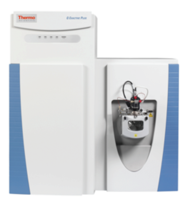
Figure 5. Q Exactive BioPharma MS/MS Hybrid Quadropole-Orbitrap

Headlining the new ThermoFisher Scientific launches was the Q Exactive BioPharma MS/MS Hybrid Quadropole-Orbitrap mass spectrometer that takes full advantage of the high-resolution, accurate-mass (HRAM) capabilities of the Orbitrap mass analyser to enable key workflows for protein characterisation in a single instrument. Combined with sample preparation and analysis methods using ThermoFisher Scientific reagents, columns, UHPLC and data processing technologies, the Q Exactive BioPharma system provides a comprehensive solution for customers performing biopharmaceutical characterisation.