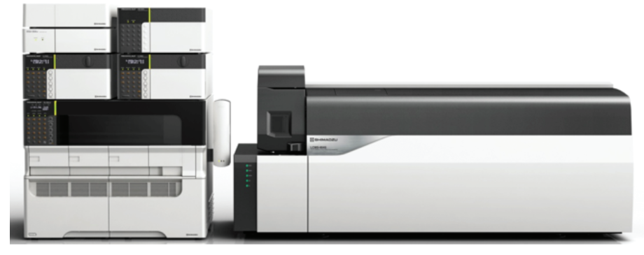
Figure 4. The Shimadzu LCMS-8045 for routine quantitative analyses

The new LCMS-8045 for routine quantitative analyses in such areas as food safety and environmental testing provides a balance of sensitivity, robustness, and cost-effectiveness operated by using Shimadzu's LabSolutions software. It features some of the components of higher performance models such as the 8040 optics and a heated source. In addition, the ion source features a cable-less, tubeless housing and the desolvation capillary can be replaced without breaking vacuum resulting in easier maintenance and a lower cost of ownership. The shipments of LCMS-8045 will start at the end of summer.