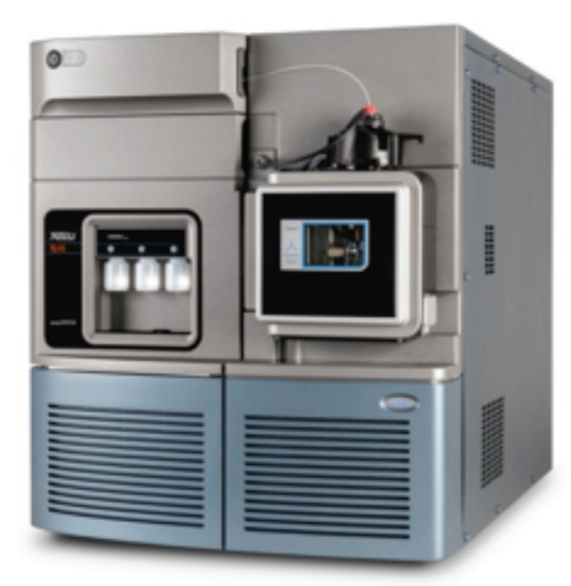
Figure 6. Xevo® TQ-XS mass spectrometer

Unveiled the new Xevo® TQ-XS mass spectrometer, the most sensitive benchtop tandem quadrupole instrument available. Enabled by the newly designed StepWave™ XS ion guide, this mass spectrometry system features a unique combination of ion optics, detection and ionisation technologies resulting in high levels of sensitivity. The Xevo TQ-XS is expected to be available for shipment in June 2016.