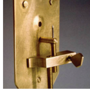
Figure 2. A representation of Van Leeuwenhoek's first microscope

Perhaps one of the most widely used staining methods in Microbiology is the Gram Stain, and although one of the simplest staining methods used, it is one of the most fascinating