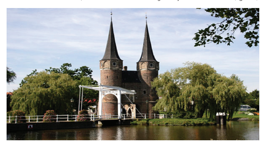
Figure 1. The famous Lions Gate

Some of the most important origins of staining date back not to a scientist, but to a Dutch draper known as Antonie Van Leeuwenhoek (1632 – 1734), whose hobby was the grinding of glass, which he used to examine threads in fabrics and later a variety of biological samples. Born Thonis Philipszoon, he became known as Van Leeuwenhoek perhaps as he was born in a house on the corner of Lions Gate in Delft, Van Leeuwenhoek translating literally as From Lions Gate. (Figure 1)