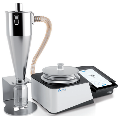
AS 200 jet pro with Cyclone